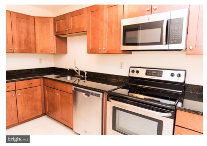
Kitchen - Renovated in 2016