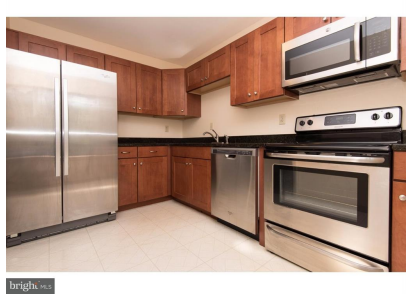
Kitchen - Renovated in 2016