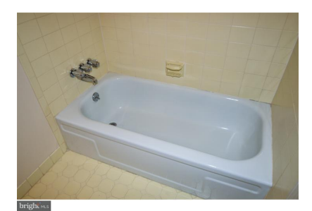
Hall Bathroom Tub