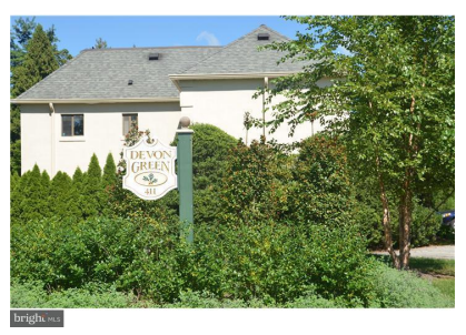
Location, Privacy, Quiet -Welcome to Devon Green!