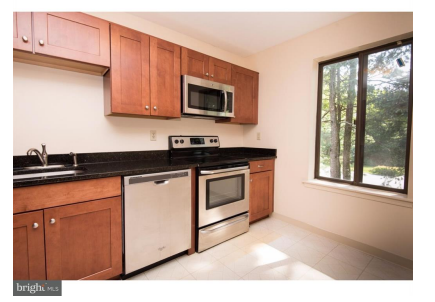
Kitchen - Renovated in 2016