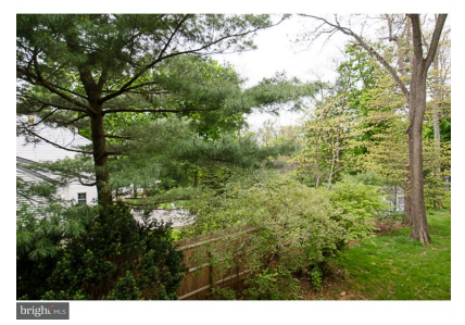
View in Back