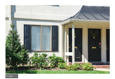
We would love for this to be your next home!

© BRIGHT MLS - All information, regardless of source, should be verified by personal inspection by and/or with the appropriate professional(s). The information is not guaranteed. Measurements are solely for the purpose of marketing, may not be exact, and should not be relied upon for loan, valuation, or other purposes. Copyright 2020. Created: 07/30/2020 06:04 PM