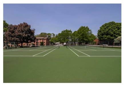
Community Tennis Court

© TREND - All information, regardless of source, should be verified by personal inspection by and/or with the appropriate professional(s). The information is not guaranteed. Measurements are solely for the purpose of marketing, may not be exact, and should not be relied upon for loan, valuation, or other purposes. Copyright 2018. Created: 08/13/2018 09:10 AM