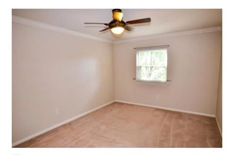
Bedroom - Main