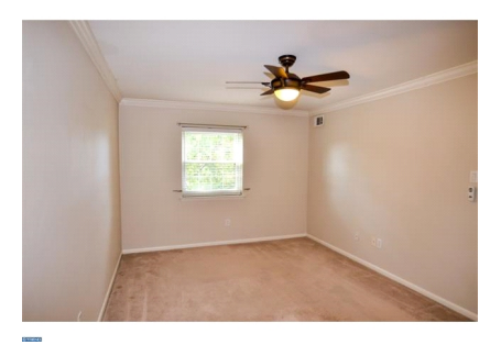
Bedroom - Main