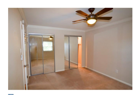
Bedroom - Main