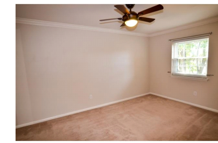
Bedroom - Main