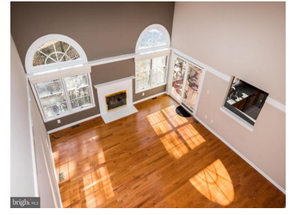
Great Room from Above Looking Finished Lower Level Toward Kitchen