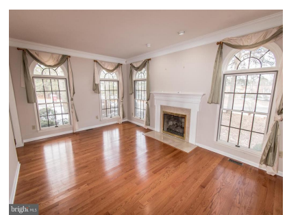
Living Room with Palladian Arched Kitchen Windows