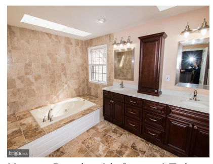
Master Baath with Jacuzzi Tub