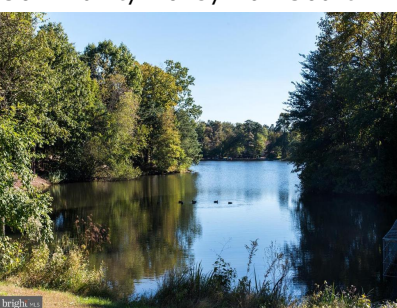
Sturbridge Lakes Community