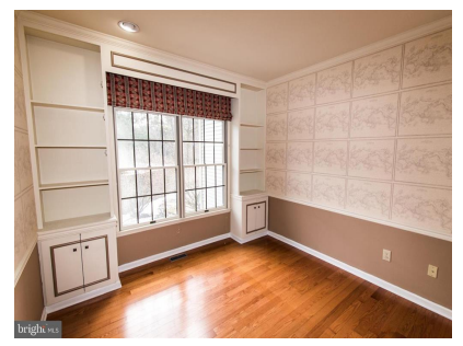
Office / Den off of Living Room