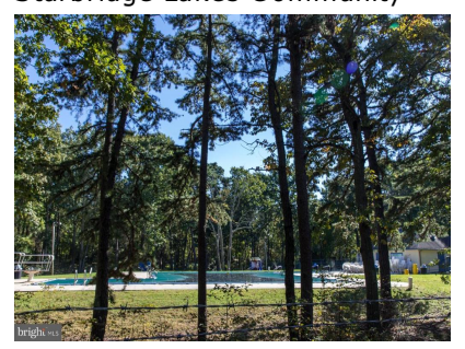
Sturbridge Lakes Community