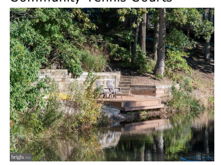
Sturbridge Lakes Community