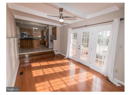
Family Room Looking Toward Kitchen