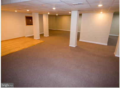
Finished Lower Level