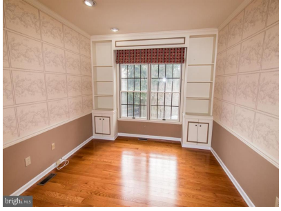
Office / Den off of Living Room