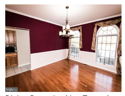
Dining Room Looking Toward Butler's Pantry