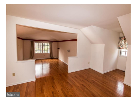
Master Bedroom Suite Sitting Room