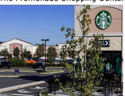
The Promenade Shopping Center The Promenade Shopping Center The Promenade Shopping Center