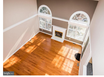
Great Room from Above