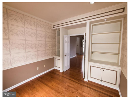
Office / Den with Built-In Shelving Formal Dining Room