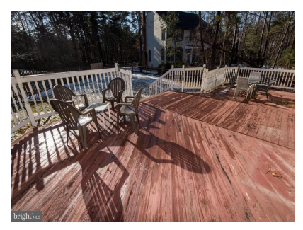
Exercise Room in Lower Level