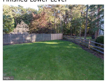
Exterior Rear View of House