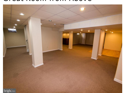
Finished Lower Level