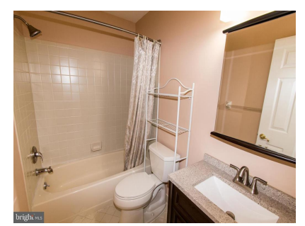
Hall Bath with Tub