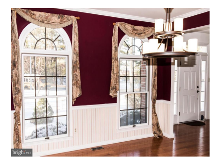
Palladian Arched Windows in Dining Room