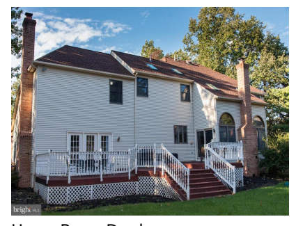
Huge Rear Deck