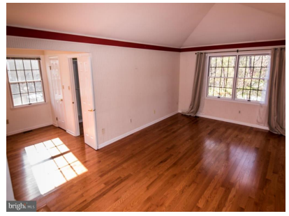
Master Bedroom Suite Looking Toward Walk-In Closet