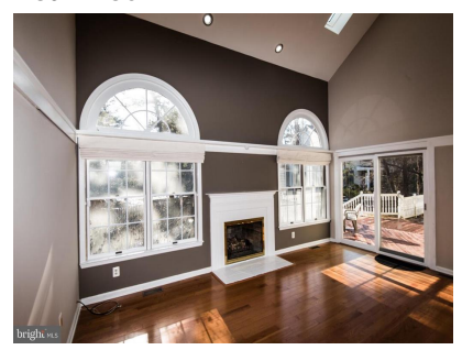
Great Room Looking Toward Rear Deck