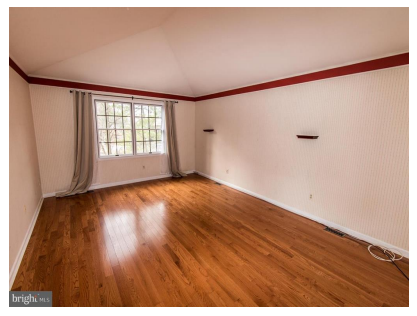
Master Bedroom Suite