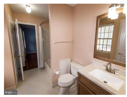
Jack and Jill Bath Shared by Bedrooms Two & Three