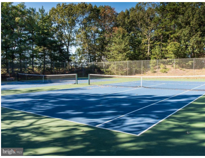
Community Swim Club