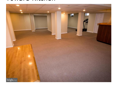
Finished Lower Level From Bar