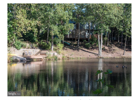
Community Basketball Court