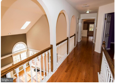
Second Floor Hallway