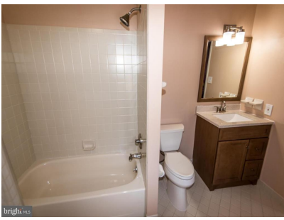
Jack and Jill Bath Shared by Bedrooms Two & Three