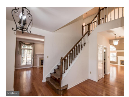
Entrance Foyer Looking Toward Living Room