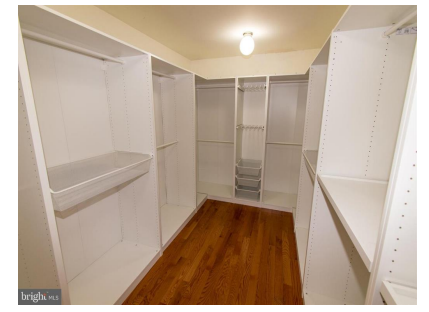
Master Bedroom Suite Walk-In Closet