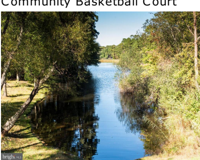
Sturbridge Lakes Community