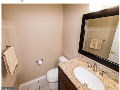
First Floor Half Bath