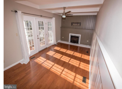
Family Room Looking Toward Rear Deck