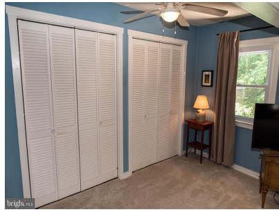
Master Bedroom Closets