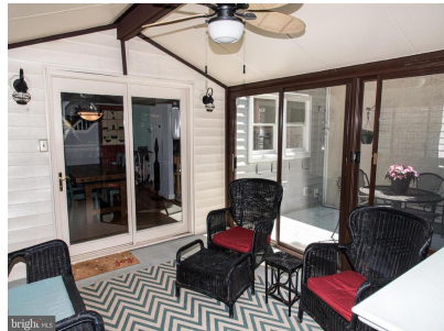
Sunroom in Rear