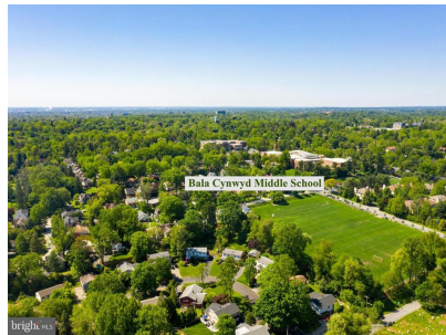
View Bala-Cynwyd Middle School from Above!