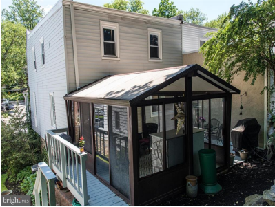
View from Rear Yard