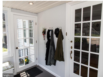
Front Enclosed Porch