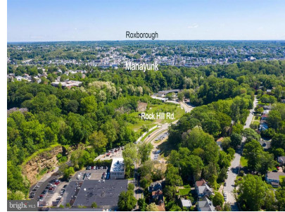
View Toward Manayunk from Above!