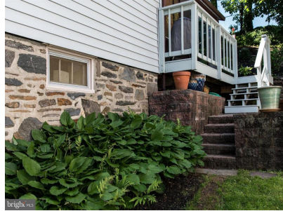
Side Yard Steps to Rear Sunroom