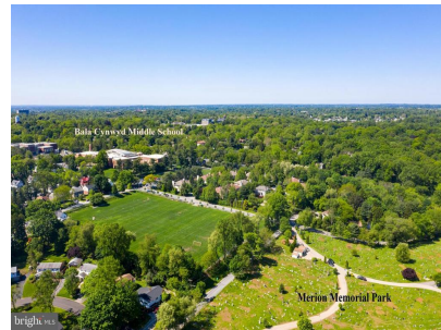
View of Merion Memorial Park from Above!