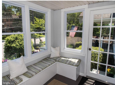
Front Enclosed Porch