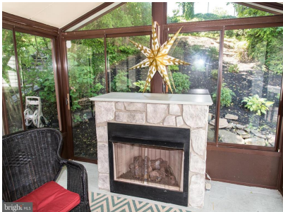
Sunroom in Rear