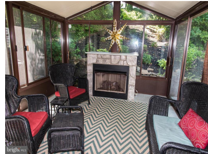
Sunroom in Rear