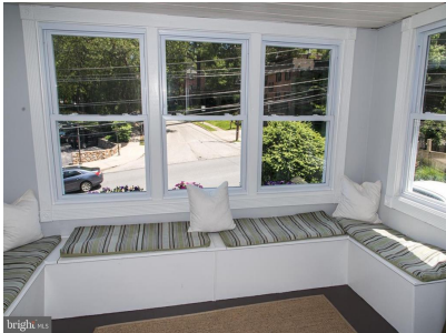
Front Enclosed Porch