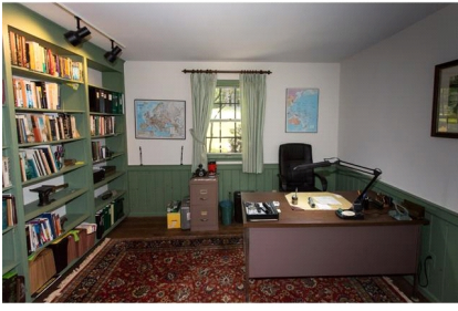
Office / Study