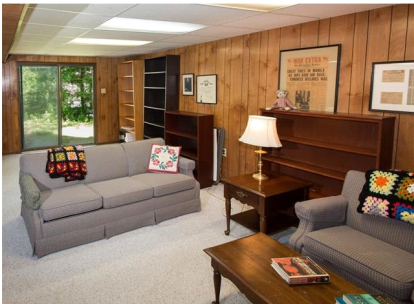
Basement - Finished