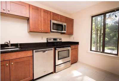
Kitchen - Renovated in 2016