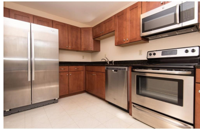
Kitchen - Renovated in 2016