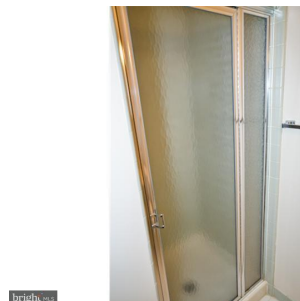
Master Bathroom Stall Shower