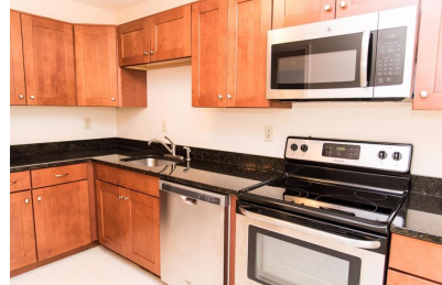
Kitchen - Renovated in 2016