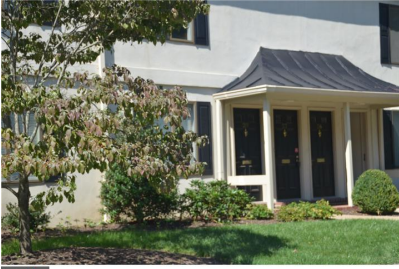
Second floor unit.