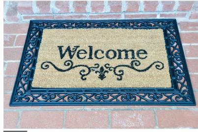
Managed by owner.