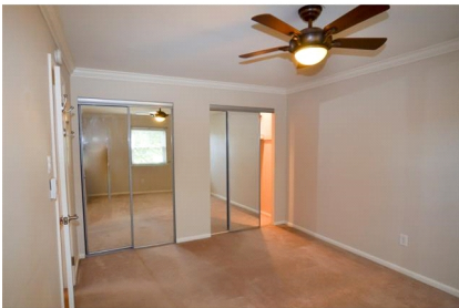
Bedroom - Main