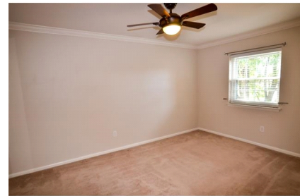
Bedroom - Main