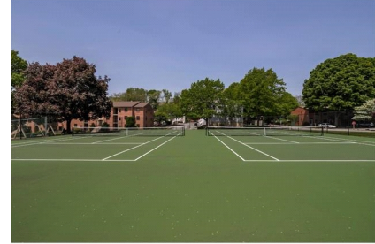
Community Tennis Court