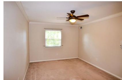
Bedroom - Main