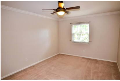
Bedroom - Main