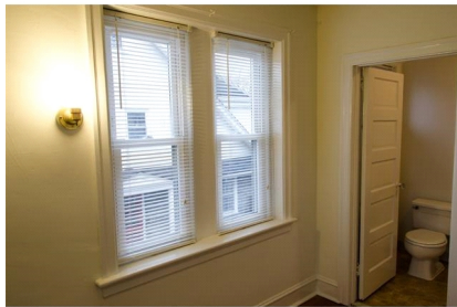
Office / Study