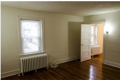
Bedroom - Main