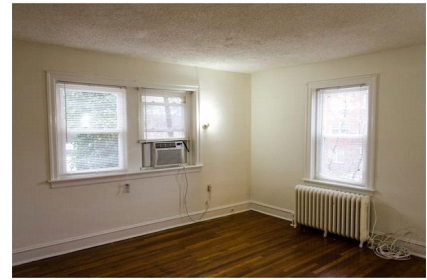
Bedroom - Main