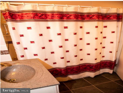
Hall Bathroom Tub