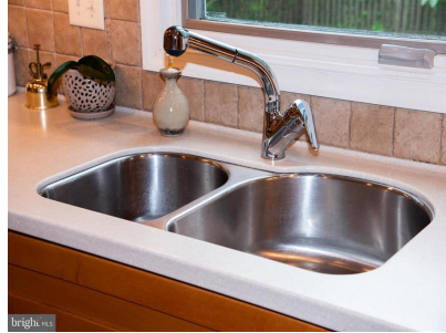
Kitchen Double Sink