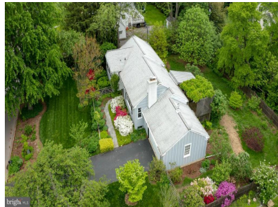
Exterior From Above