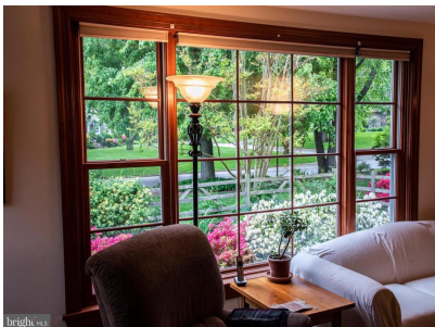
Living Room View