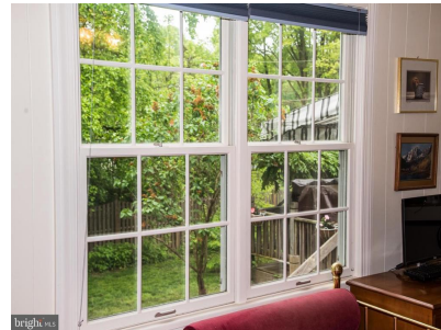
Bedroom Three View to Rear Yard