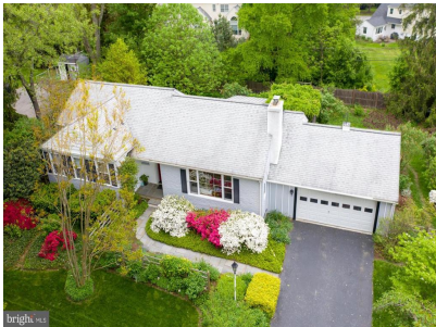
Exterior From Above