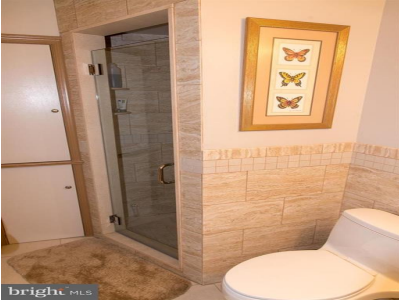
Master Bathroom Stall Shower