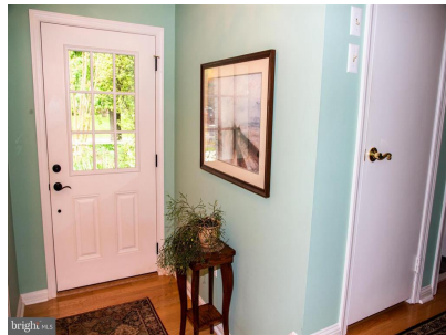
Front Door and Foyer