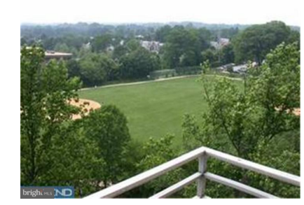
View in Back

© BRIGHT MLS - All information, regardless of source, should be verified by personal inspection by and/or with the appropriate professional(s). The information is not guaranteed. Measurements are solely for the purpose of marketing, may not be exact, and should not be relied upon for loan, valuation, or other purposes. Copyright 2020. Created: 06/04/2020 11:11 AM