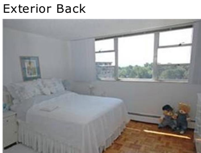
Bedroom - Main